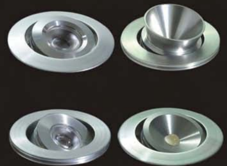
LED Under Cabinet Light (4LED)