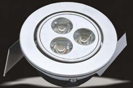
3 * 1W LED Recessed Downlight

3W *3 version is available too, light output 240lm (Taiwan Chip), 360lm (Cree Chip)