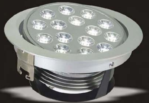
15 *1W LED Recessed Downlight