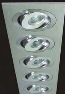
LED Under Cabinet Light (5LED)